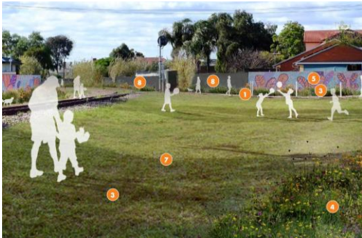
Artist's impression of a section of the proposed Loop plans now available on the DIT website. (detail)