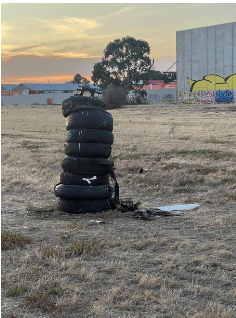
Gillman yards, February 2025 some locals call it 'tyre flats'!

Light, noise and air pollution from industry are serious issues for those living near the Gillman yards, with this area considered at the top limit for air pollution for SA.